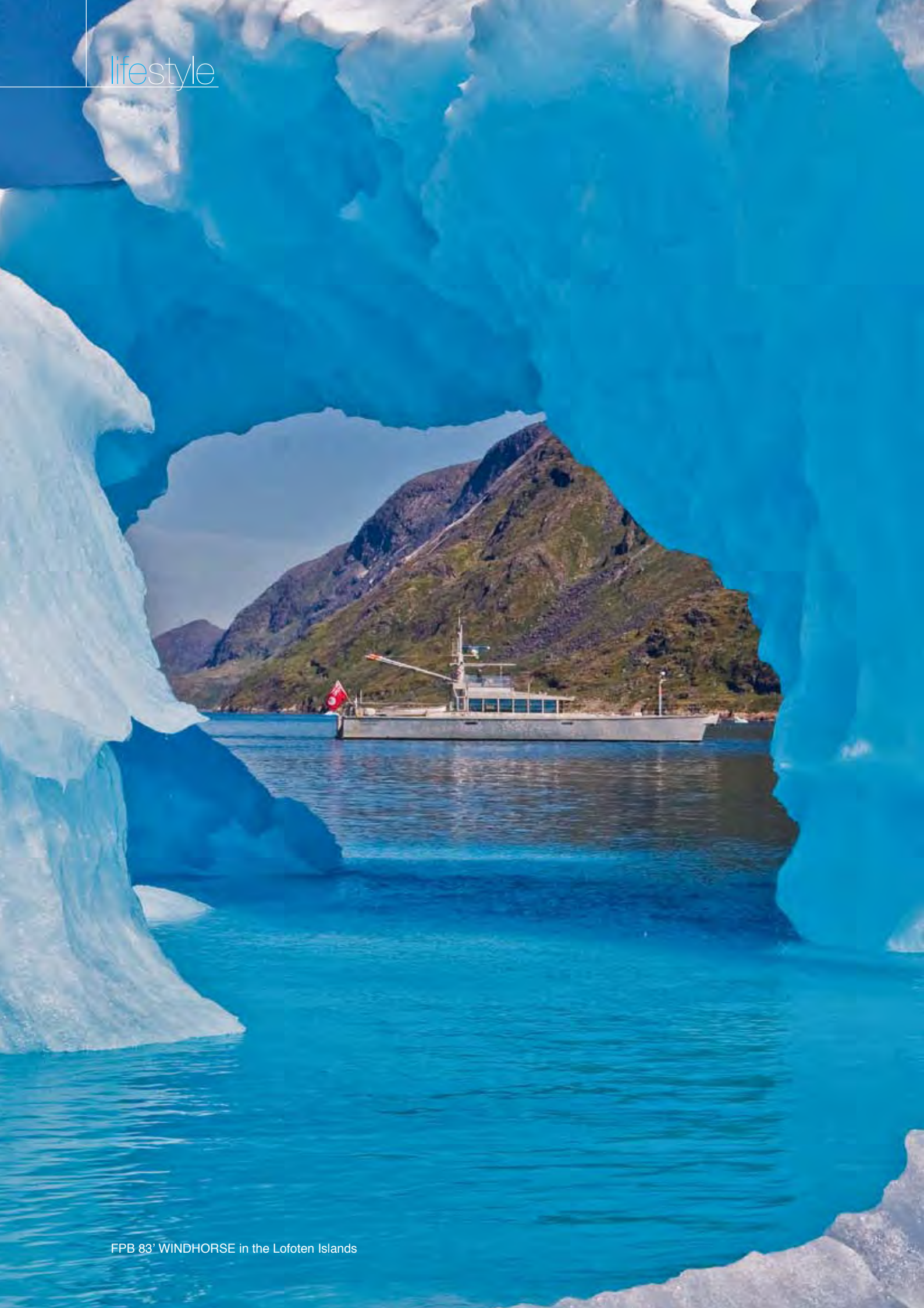
FPB 83' WINDHORSE in the Lofoten Islands