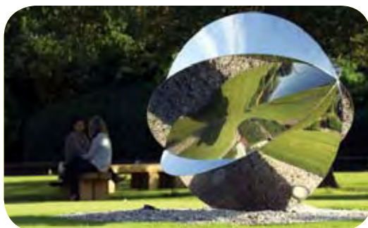
56 Project art