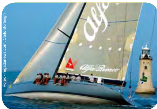
48 Guaranteed respect